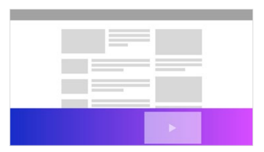
AstroBoard expanded (desktop)