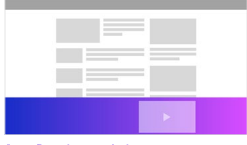
AstroBoard expanded (desktop)

Formats ............ JPEG/GIF/PNG/HTML5 Creative size ... 300 x 250px File size ............ 50KB max