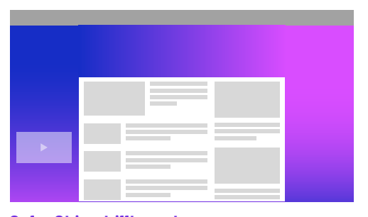
Solar Skin - billboard