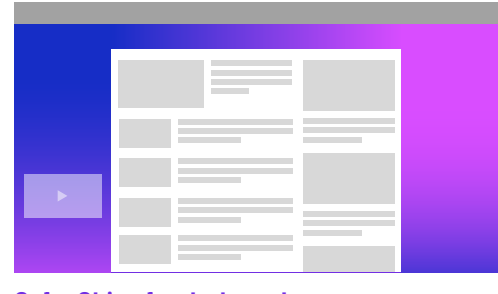
Solar Skin - leaderboard